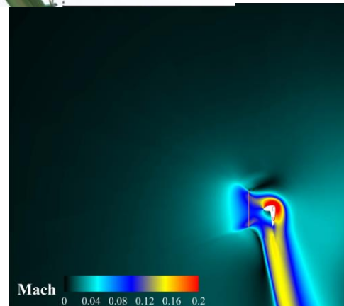
CFD simulated VTOL enabled by CFJ