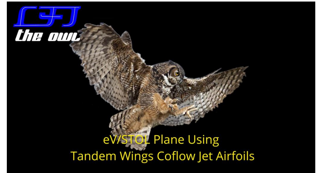
2 nd Gen eV/STOL